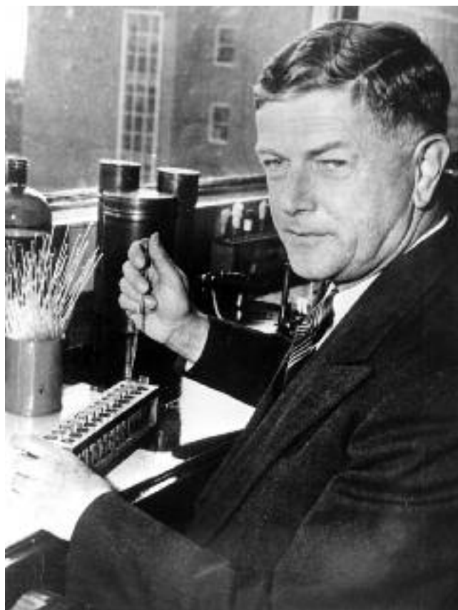
Dr Macfarlane Burnet at the Walter & Eliza Hall Institute for Medical Research in the mid-1950s.

It is believed that the advantages of Jerne's theory can be obtained and the difficulties overcome if the production of foreign pattern is limited to cells of immunologic type and not