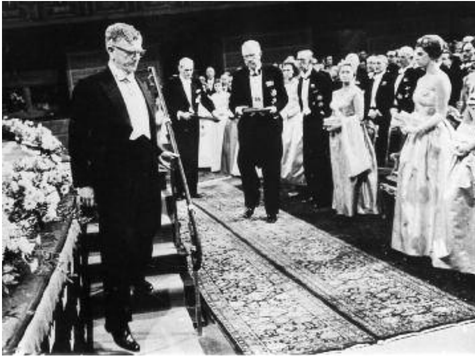
Sir Macfarlane Burnet receiving Nobel Prize for Medicine or Physiology, Stockholm, December 1960.