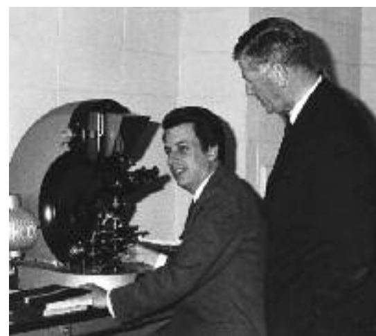
Sir Macfarlane Burnet (right) and Professor Gustav Nossal, his successor as Director of the Walter & Eliza Hall Institute of Medical Research, ca 1965.