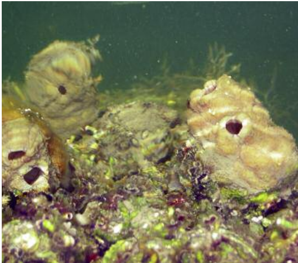
Sedentary sex: sea squirts live life stuck to the substrate, so they reproduce by squirting their eggs and sperm out into the ocean.

Hence broadcast-spawning mothers have two different properties of their eggs that they can potentially adapt to increase their reproductive success. Accessory structures provide a cheap way of increasing the target size of the egg (with consequences for fertilisation success), while the ovicell represents the main energetic investment in the egg (with consequences for offspring number and survival).