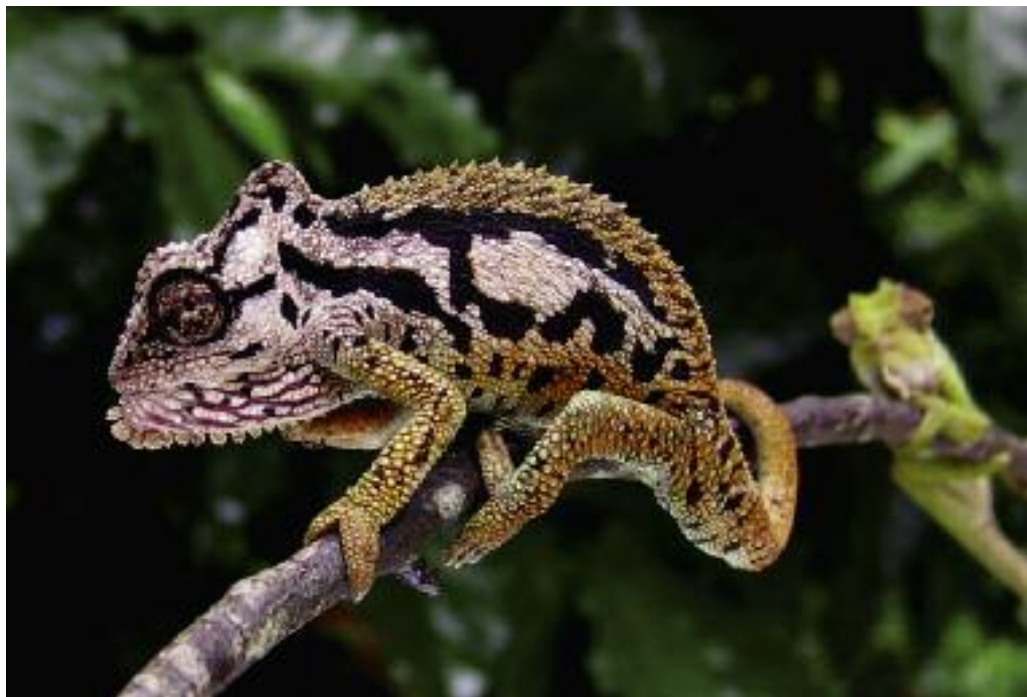
Showing off to girls. A male Transvaal dwarf chameleon puffs out his throat and presents his best side to a female

How do we know that chameleon display colours are eye-catching to another chameleon – or, for that matter, to a predatory bird? Measuring the colour of the chameleons and their backgrounds is only the first step. Getting a view from the perspective of chameleons or their bird