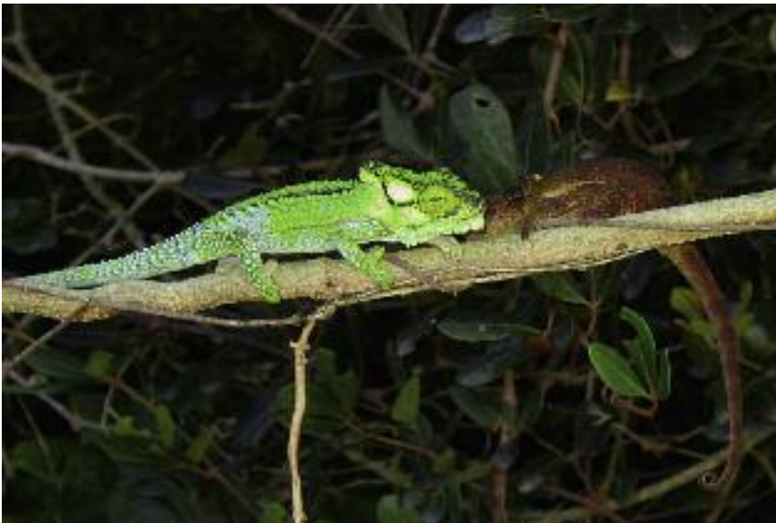
Game over! The male Knysna dwarf chameleon on the right concedes defeat by switching to submissive colouration.

fighting, courting, mating and looking out for predators. Chameleons are known as masters of camouflage with good reason. Researchers must generally find chameleons at night when they are asleep and become very pale, standing out against the dark vegetation in torchlight. I spent 4 years in South Africa doing just this to discover why colour change evolved.