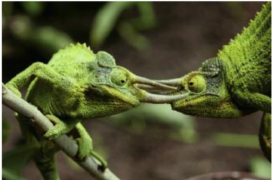
Game on! Two male Jackson's chameleons put on their brightest fighting colours and lock horns.

Colour change in chameleons occurs through the movement of pigments within specialised cells in the skin called chromatophores. There are several types of chromatophore that contain different types of pigment or light-reflecting crystalline structures. Some chromatophores have many arms, like a starfish, extending