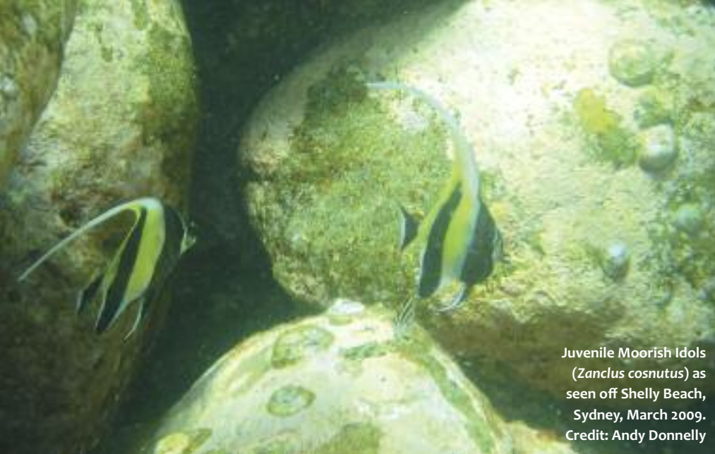
Juvenile Moorish Idols ( Zanclus cornutus ) as seen off Shelly Beach, Sydney, March 2009.