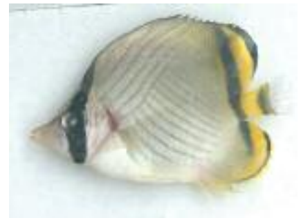
This 50 mm butterflyfish ( Chaetodon cintrinellis ) was collected in NSW waters during the vagabond fish study.

“We find certain species drop off in northern NSW, while others survive further south to near Eden and Merim-