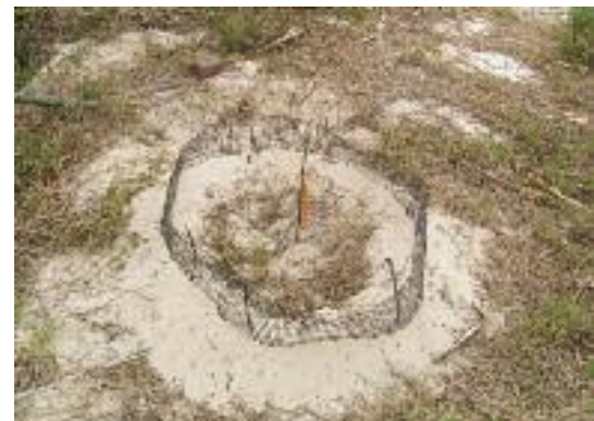
Figure 1. A corral set up to trap green turtle hatchlings as they emerge from their nest.

To test this idea I needed to measure the swimming effort and rate of energy expenditure of hatchlings within minutes of them emerging from their nests. The University of Queensland’s research station on Heron Island was the ideal place to work because the laboratory is only a few hundred metres from where the hatchlings emerge from their nests.