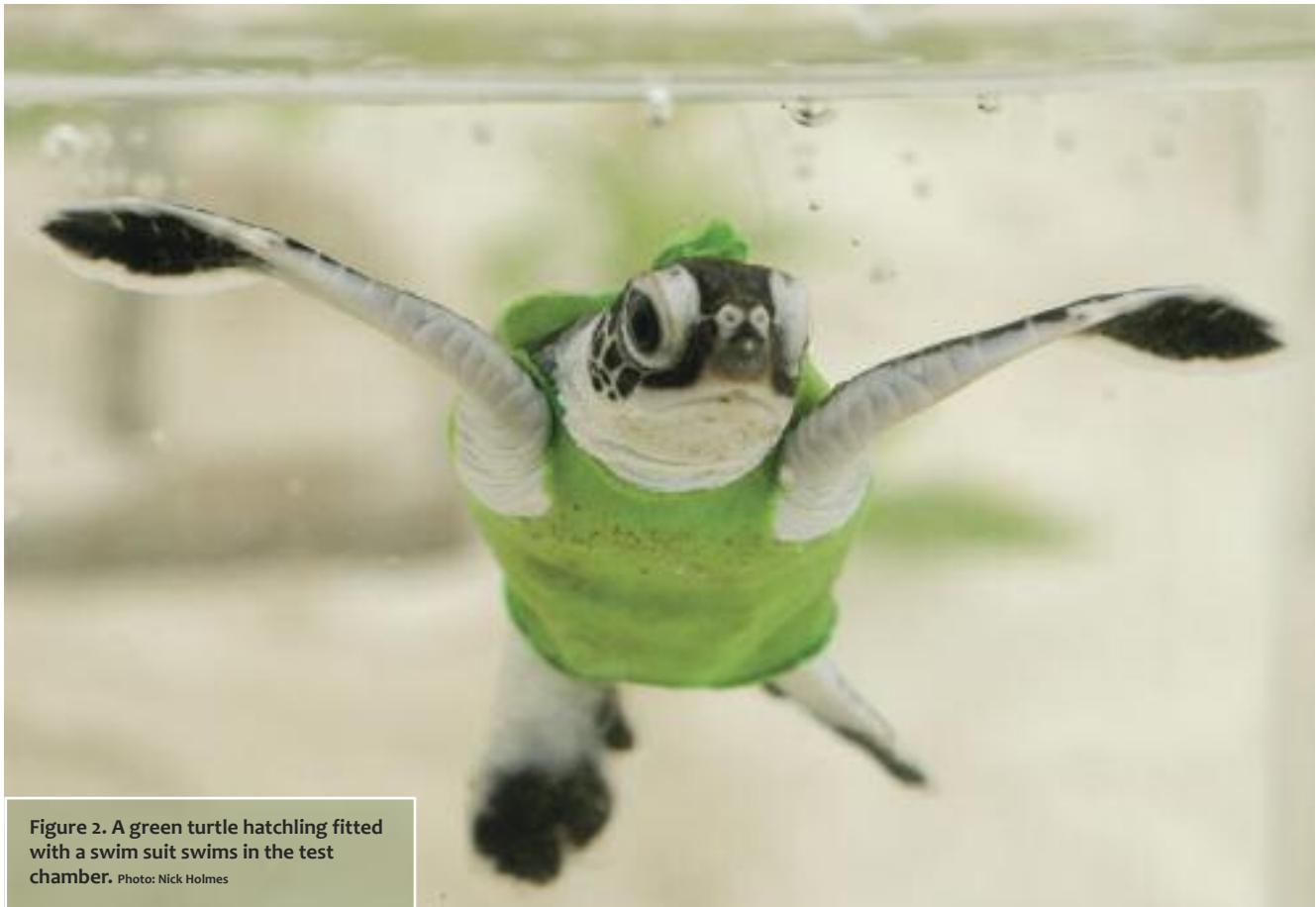
Figure 2. A green turtle hatchling fitted with a swim suit swims in the test chamber.

The first job was to catch hatchlings as they left the nest. This was done by placing corrals on the sand above nests that were near hatching (Fig. 1). Corrals were visited regularly throughout the night so that a hatchling could be collected within minutes of reaching the sand's surface. The hatchling was transported in a bucket to the laboratory, where it was weighed and its carapace length and width measured. The hatchling was then fitted with a lycra swimsuit that had a tether made of fishing line attached to it (Fig. 2).