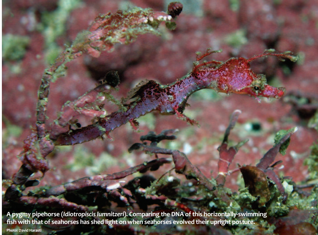
A pygmy pipehorse ( Idiotropiscis lumnitzeri ). Comparing the DNA of this horizontally-swimming fish with that of seahorses has shed light on when seahorses evolved their upright posture.

After benefitting from the rapid expansion of seagrass meadows in Australasia, seahorses gradually established themselves in tropical and temperate regions throughout the world. How they did this